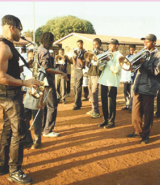
Workshop in Soweto

I had always tried to prepare myself mentally for the day when I would be on tour and receive bad news. Coming from a large family, having seven sons and four daughters of my own and living in a community where black-on-black crime had never been higher, it was only a matter of time before trouble would come knocking at my door.