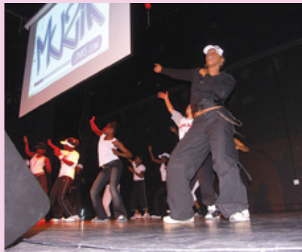
Muzik Links dance performance

The kids at the community center were all excited and very eager to get involved so we started an enrollment sheet. By the time we were ready to start I had exhausted all my finances. The landlords were so impressed with how