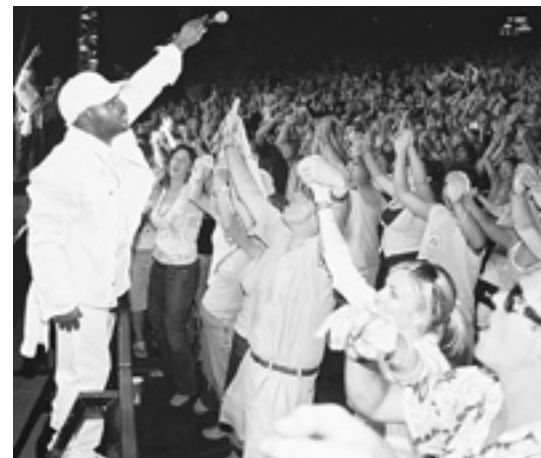
Spreading the good news By Eye N Eye Art

The whole team supported me when I joined forces with the West Midlands Police Force and Partnership Against Crime to deliver music-related activities to gang members and young people at risk. We even convinced some of the really talented gang members who wanted to make a change, to create a double CD